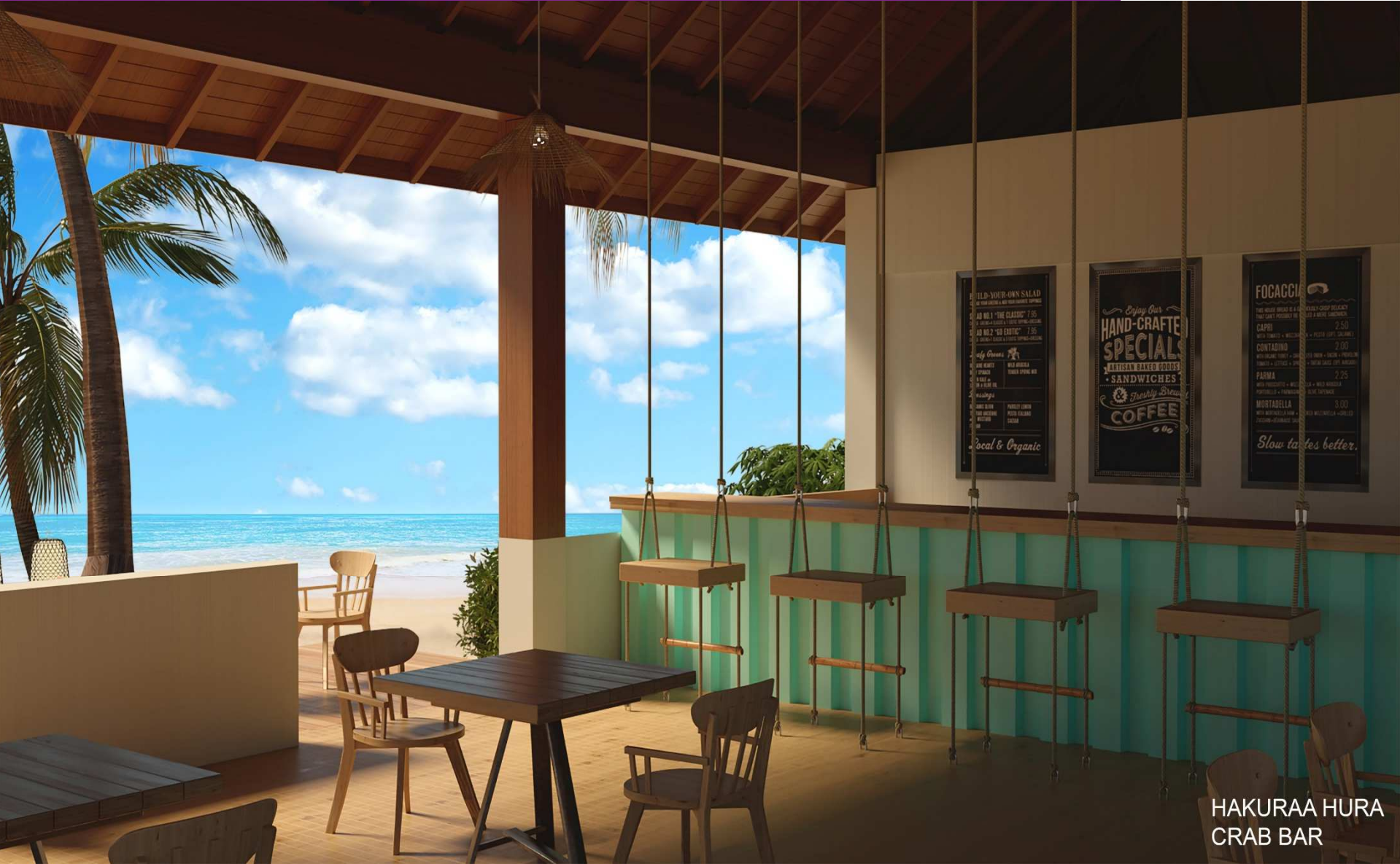
HAKURAA HURAA CRAB BAR