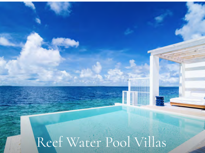
Reef Water Pool Villas

23 villas | 1 bedroom | 220sqm | Pool 4.7 x 4.2m | Max. Occupancy 2A/2C or 3A