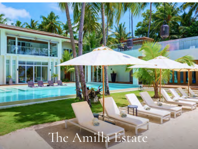
The Amilla Estate

1 mansion | 6 bedroom | 2550sqm | Pool 20 x 8m | Max. Occupancy 8A/4C or 12A