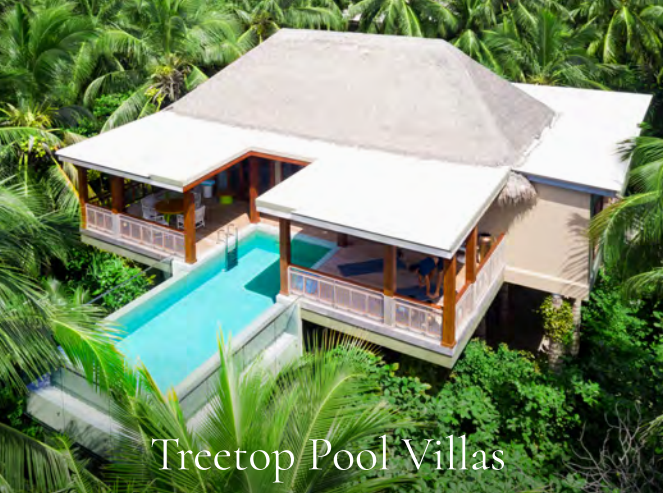
Treetop Pool Villas