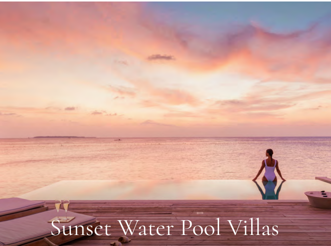
Sunset Water Pool Villas

10 villas | 1 bedroom | 220sqm | Pool 7.2 x 2m | Max. Occupancy 2A/1C or 3A