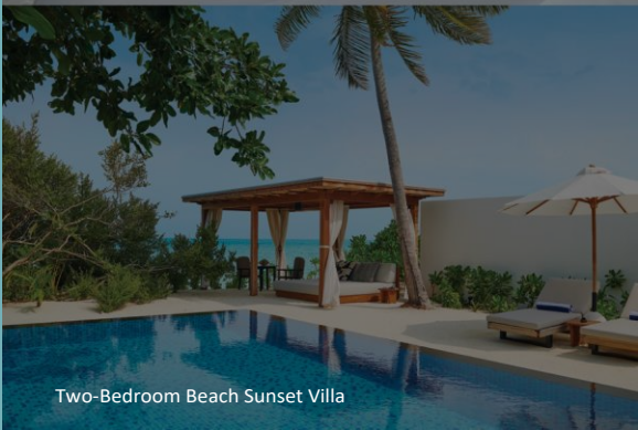
Two-Bedroom Beach Sunset Villa