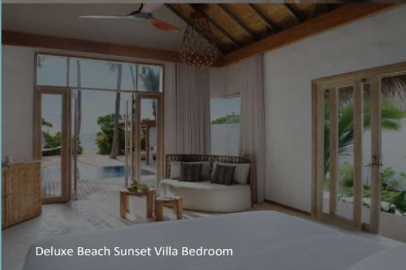
Deluxe Beach Sunset Villa Bedroom