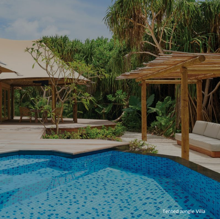
Tented Jungle Villa

The beaches sparkle a shade of white you've never seen before; the turquoise waters of the Indian Ocean glimmer in the tropical sun; the wind blows gently through mangrove and jungle. Welcome to Sirru Fen Fushi, or "Secret Water Island," the most exclusive island in all of the Maldives' 26 atolls. It's all yours to explore at Fairmont Maldives, Sirru Fen Fushi, where our sophisticated beach, over-water and jungle villas immerse you in comfort, romance and island charm. The sights and sounds of nature greet you each morning; the bounty of the ocean awaits at night. And all day long, the vibrant spirit of the Maldives shines through every inch of the island, showing you a life you always dreamed was possible.