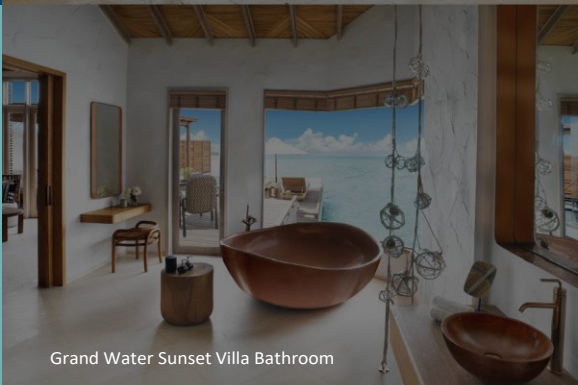
Grand Water Sunset Villa Bathroom