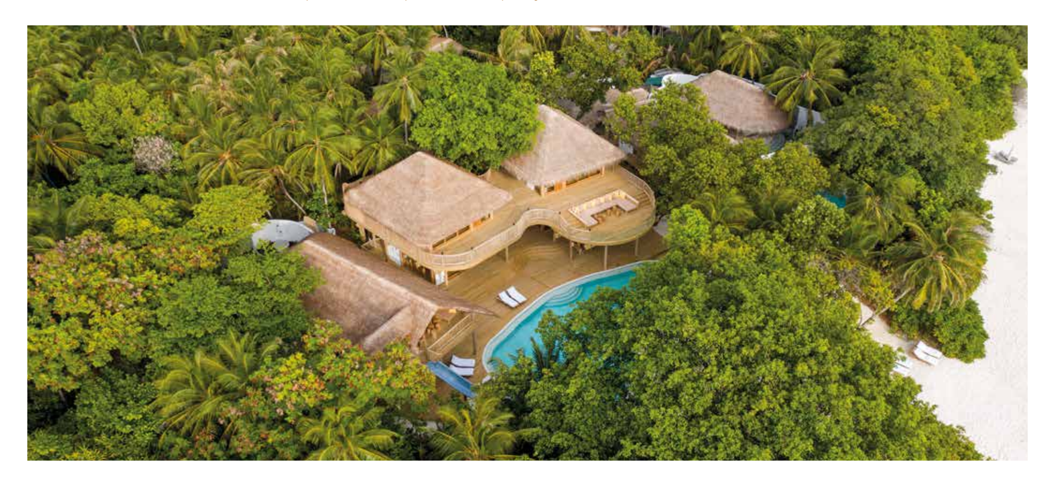
Six bedrooms Total area 2,234 sqm. / 24,046 sq.ft. | Max occupancy – twelve adults and six children or sixteen adults