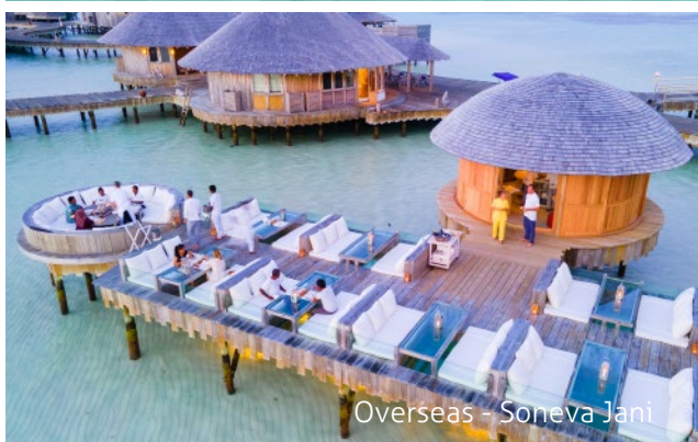
Overseas - Soneva Jani