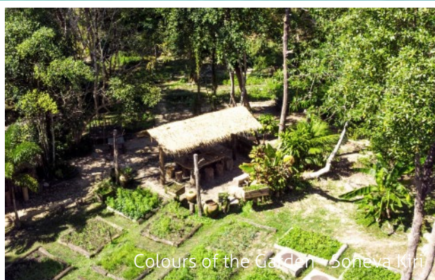
Colours of the Garden - Soneva Kiri