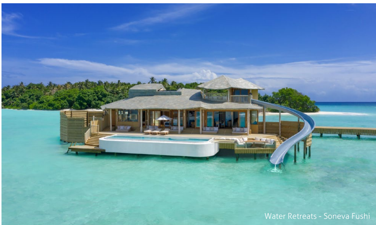
Water Retreats - Soneva Fushi

Colours of the Garden - Soneva Kiri - Venture on a journey through the four culinary regions of Thailand across four different menus. Begin the meal with a guided tour of the garden, where amuse bouche have been hidden along the way. Each menu has seven plant-based courses that use traditional Thai ingredients and Nordic cooking techniques and cooking methods. Each dish celebrates Soneva Kiri-grown and local organic vegetables, fruits and herbs.