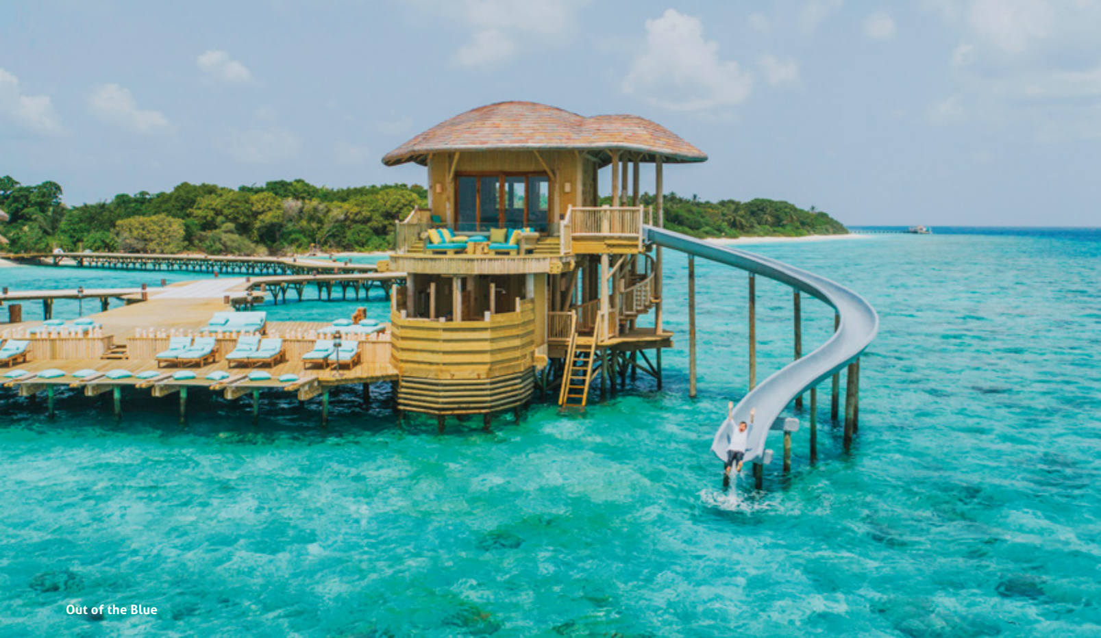
Out of the Blue