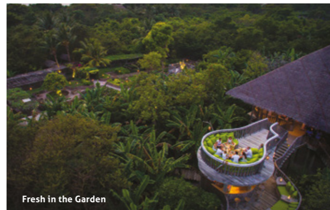
Fresh in the Garden

Flames and smoke set the stage for So Bespoke, Out of the Blue's open-air Teppanyaki table.