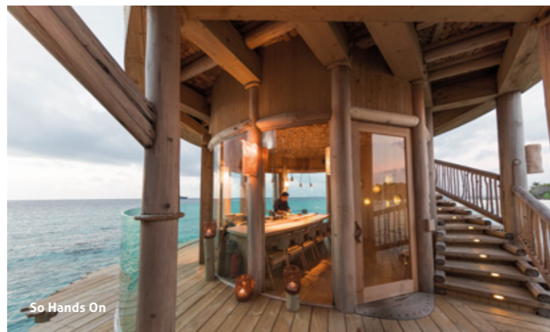
So Hands On