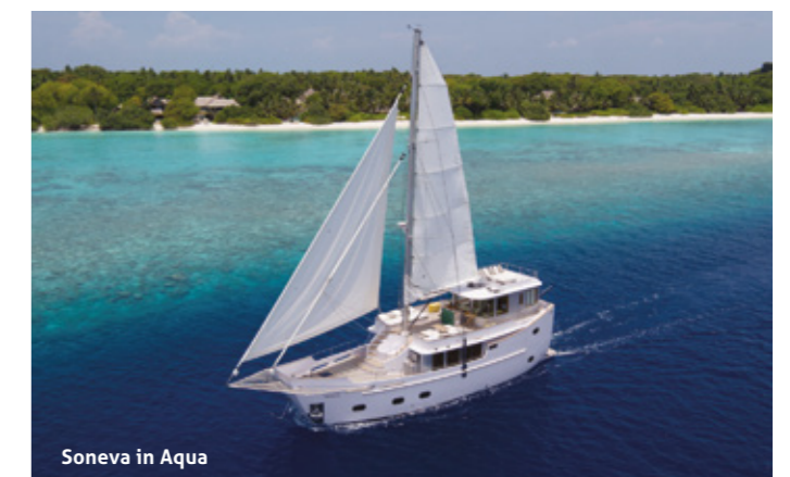
Soneva in Aqua

A luxurious floating villa that sets sail from Soneva Fushi, Soneva in Aqua affords guests the luxury of three charter routes that sail around and beyond the Baa Atoll. Guests can choose between one, two and three-night excursions depending on how much of the awe-inspiring sights of the Indian Ocean they wish to explore.