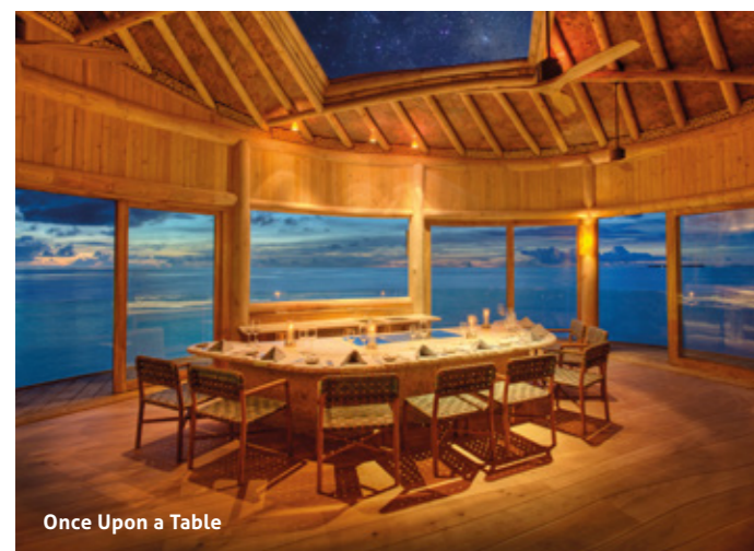
Once Upon a Table

A culinary theatre showcasing a no menu concept only for visiting chefs. 8 seats only.